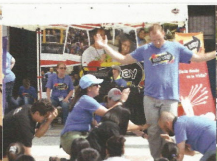
AMT School Outreach