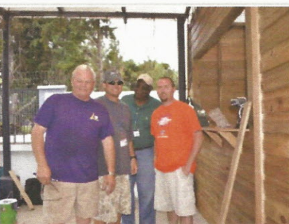
AMT Construction Project